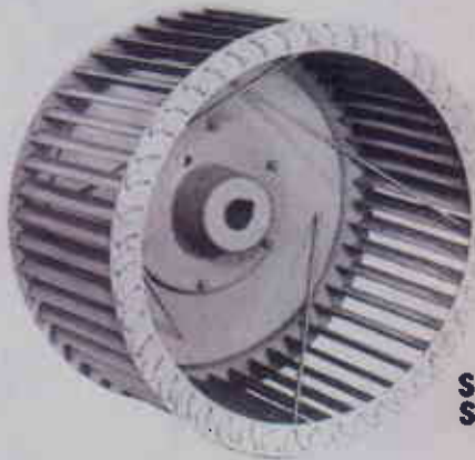
SMB & SMD