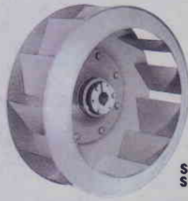
SMBI & SMDI

Heavy duty dynamically balanced wheel with die-formed blades and reinforcement rods (except size 8). Available in diameters from 7 \frac{1}{16} " thru 15".